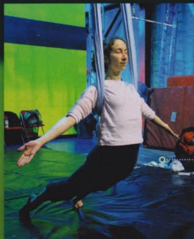
aerial upward facing dog

enjoy seeing how the physical and the emotional/mental are intertwined, I've been finding more freedom in other areas of my life as well as in my body."